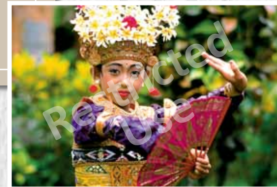
Legong Dancer in Bali, Indonesia

Book by April 30, 2010 and you're guaranteed these 2-for-1 fares — or better! PLUS, enjoy free airfare and up to $10,000 Cruisebank shipboard credit per couple. Call your Virtuoso® travel advisor today!