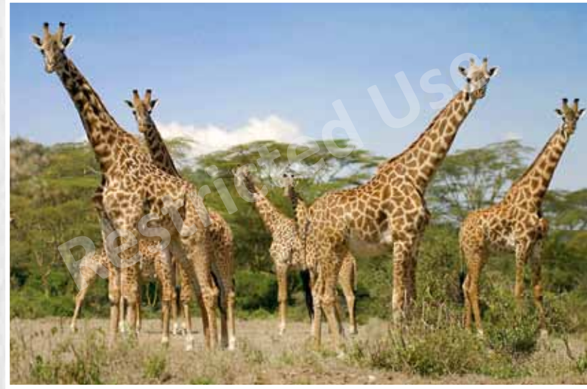
Top: Overlooking the Tahitian waters; Bottom: A giraffe gathering in Mombasa, Kenya

While onboard the Crystal Serenity , you'll delight in the absolute pinnacle of travel and spend days at sea rejuvenating and reconnecting with loved ones, friends and even yourself. And in each port, you'll take in the sights, the tastes, the sounds that make our world so enchanting. Destination-rich and undoubtedly luxurious, Crystal Cruises' global voyage introduces you to the world you thought you knew, all over again.